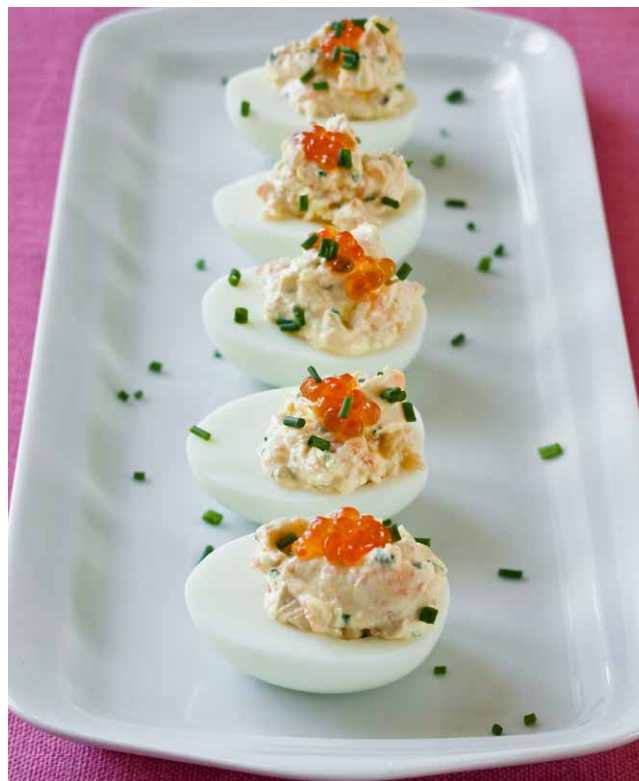
Smoked Salmon Deviled Eggs, How Easy Is That? 40

Bay Scallop Ceviche, Cook Like a Pro 27 Blini with Smoked Salmon, Barefoot in Paris 33 Buffalo Chicken Wings, Family Style 36 Caramelized Bacon, Foolproof 31 Caviar Dip, Parties! 78 Chopped Liver, Parties! 58 Crab Cakes with Rémoulade Sauce, Barefoot Contessa Cookbook 44 Crab Strudels, Foolproof 34 Crostoni with Tuna Tapenade, How Easy Is That? 47 Filet of Beef Carpaccio, Cook Like a Pro 73 Foie Gras with Roasted Apples, How Easy Is That? 78 Fresh Crab Nachos, Modern Comfort Food 44 Fresh Salmon Tartare, How Easy Is That? 77 Fried Oysters with Lemon Saffron Aioli, Cooking for Jeffrey 30 Gravlax with Mustard Sauce, Back to Basics 34 Grilled Lemon Chicken with Satay Dip, Barefoot Contessa Cookbook 48 Grilled Oysters with Lemon Dill Butter, Modern Comfort Food 48 Kielbasa with Mustard Dip, Modern Comfort Food 52 Lamb Sausage in Puff Pastry, Barefoot Contessa Cookbook 42 Lobster Corn Fritters, Foolproof 90 Lobster Salad in Endive, Barefoot Contessa Cookbook 43 Mussels & Basil Bread Crumbs, How Easy Is That? 80 Mussels with Saffron Mayonnaise, Foolproof 71 Potato Galettes with Smoked Salmon, Modern Comfort Food 39 Potato Pancakes with Caviar, Parties! 169 Roasted Figs & Prosciutto, How Easy Is That? 28 Roasted Shrimp Cocktail, Back to Basics 38 Roasted Shrimp Cocktail Louis, Cook Like a Pro 32 Sausage & Mushroom Strudels, Cook Like a Pro 34