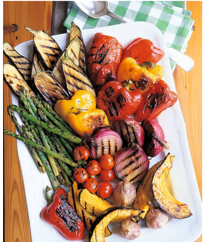
Grilled Vegetables, Barefoot Contessa Cookbook 166

Green Green Spring Vegetables, At Home 141 Grilled Vegetables, Barefoot Contessa Cookbook 166 Haricots Verts with Hazelnuts & Dill, Cook Like a Pro 152 Herb-Roasted Onions, At Home 156 Maple-Roasted Acorn Squash, Cook Like a Pro 155 Maple-Roasted Butternut Squash, Back to Basics 158 Mashed Butternut Squash, Family Style 127 Mashed Yellow Turnips with Crispy Shallots, Family Style 112 Orange-Braised Carrots & Parsnips, Foolproof 170 Orange-Honey Glazed Carrots, At Home 133 Orange-Roasted Rainbow Carrots, Cook Like a Pro 156 Oven-Roasted Vegetables, Back to Basics 171 Pan-Roasted Root Vegetables, Back to Basics 176 Parmesan Fennel Gratin, Foolproof 176 Parmesan Pesto Zucchini Sticks, Cook Like a Pro 159 Parmesan-Roasted Broccoli, Back to Basics 172 Parmesan-Roasted Cauliflower, At Home 146 Parmesan Roasted Zucchini, Cooking for Jeffrey 134 Pear & Parsnip Gratin, Make It Ahead 161 Peas & Pancetta, Make It Ahead 158 Provençal Cherry Tomato Gratin, Foolproof 173 Provençal Tomatoes, Family Style 116 Provençal Zucchini Gratin, Modern Comfort Food 166 Rich Celery Root Purée, How Easy Is That? 187 Roasted Baby Bok Choy, Make It Ahead 153 Roasted Baby Pumpkins, Barefoot Contessa Cookbook 153 Roasted Beets, Barefoot in Paris 150 Roasted Broccolini & Cheddar, Modern Comfort Food 150 Roasted Broccoli with Panko Gremolata, Cook Like a Pro 164 Roasted Broccolini, Cooking for Jeffrey 162 Roasted Brussels Sprouts, Barefoot Contessa Cookbook 150