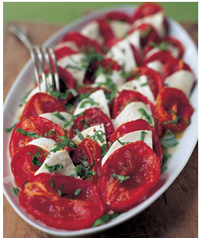
Roasted Tomato Caprese Salad, Back to Basics 90

Brown Rice, Tomatoes & Basil, Family Style 63 Charlie Bird's Farro Salad, Cook Like a Pro 46 Curried Couscous, Barefoot Contessa Cookbook 94 Farro Tabbouleh with Feta, Cook Like a Pro 51 Lentil & Kielbasa Salad, Cooking for Jeffrey 64 Lobster & Shells, How Easy Is That? 94 Pasta with Sun-Dried Tomatoes, Family Style 58 Pasta, Pesto & Peas, Parties! 101 Quinoa Tabbouleh with Feta, Make It Ahead 74 Szechuan Noodles, Barefoot Contessa Cookbook 108 Tabbouleh, Parties! 113 Wheatberry Salad, Family Style 67 Wild Rice Salad, How Easy Is That? 111