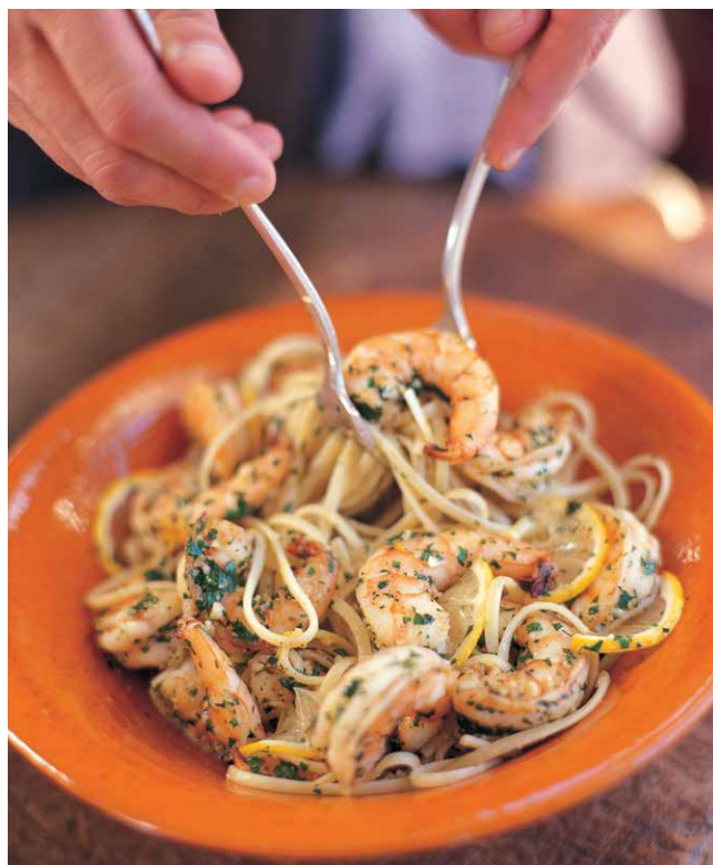
Linguine with Shrimp Scampi, Family Style 106

Seafood Platter with Mustard, Cocktail, and Mignonette Sauce, Barefoot in Paris 70 Seared Salmon with Spicy Red Pepper Aioli, Modern Comfort Food 122 Seared Scallops & Potato Celery Root Purée, Foolproof 146 Seared Tuna with Mango Chutney, At Home 122 Shellfish & Chorizo Stew, Modern Comfort Food 126 Shrimp & Grits, Cook Like a Pro 130 Shrimp & Swordfish Curry, Cooking for Jeffrey 124 Sicilian Grilled Swordfish, Foolproof 149 Swordfish with Tomatoes and Capers, Barefoot Contessa Cookbook 136 Warm Lobster Rolls, Cook Like a Pro 136