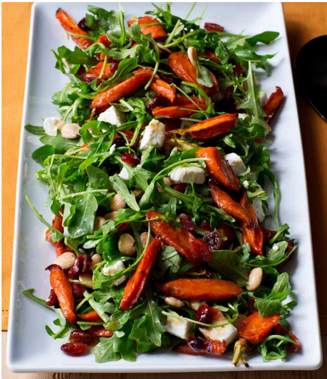
Maple-Roasted Carrot Salad, Cooking for Jeffrey 46

Blue Cheese Coleslaw, At Home 82 Broccoli with Garlic, Barefoot Contessa Cookbook 100 Broccoli & Kale Salad, Modern Comfort Food 91 Buttermilk Ranch Dressing with Bibb Lettuce, How Easy Is That? 69 Caesar Salad with Blue Cheese & Bacon, Make It Ahead 43 Caesar Salad with Pancetta, Parties! 46 Cape Cod Chopped Salad, Back to Basics 78 Celery & Parmesan Salad, How Easy Is That? 62 Celery Root Rémoulade, Barefoot in Paris 94 Charlie Bird's Farro Salad, Cook Like a Pro 46 Creamy Cucumber Salad, Back to Basics 85 Crudité Platter, Barefoot Contessa Cookbook 111 Crunchy Iceberg Salad with Creamy Blue Cheese, Make It Ahead 68 Endive and Avocado Salad, Parties! 137 Endive, Orange & Roquefort Salad, Foolproof 69