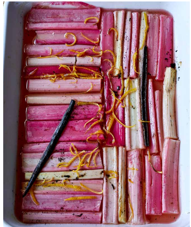
Vanilla Roasted Rhubarb with Sweet Yogurt, Cook Like a Pro 217

Vanilla Brioche Bread Pudding, Cook Like a Pro 221 Vanilla Extract, Barefoot Contessa Cookbook 199 Vanilla Roasted Rhubarb with Sweet Yogurt, Cook Like a Pro 217 Vanilla Rum Panna Cotta with Salted Caramel, Cooking for Jeffrey 198 Vanilla Semifreddo with Raspberry Sauce, Make It Ahead 227