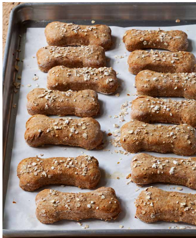
Whole Wheat Peanut Butter Dog Biscuits, Make It Ahead 18

© copyright 2020 by Ina Garten All rights reserved.