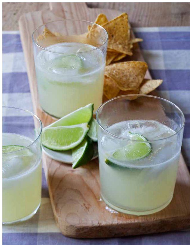
Jalapeño Margaritas, Make It Ahead 26

Fresh Lemonade, Barefoot Contessa Cookbook 32 Herbal Iced Tea, Family Style 68 Hot Chocolate, Barefoot Contessa Cookbook 225 Hot Mulled Cider, Parties! 239 Italian Iced Coffee, Cook Like a Pro 241 Mexican Hot Chocolate, Foolproof 251 Sunrise Smoothies, Back to Basics 224 The Perfect Cup of Coffee, Barefoot Contessa Cookbook 209 Tropical Smoothies, Parties! 39 Whipped Hot Chocolate, Family Style 210 Vanilla Cold-Brewed Iced Coffee, Modern Comfort Food 246 White Hot Chocolate, Barefoot Contessa Cookbook 226