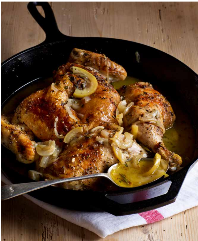
Skillet-Roasted Lemon Chicken, Cooking for Jeffrey 90

French Chicken Pot Pies, Make It Ahead 98 Fried Chicken Sandwiches, Cook Like a Pro 105 Herb-Roasted Turkey Breast, How Easy Is That? 127 Indonesian Ginger Chicken, Barefoot Contessa Cookbook 125 Jeffrey's Roast Chicken, How Easy Is That? 122 Lemon Chicken Breasts, How Easy Is That? 120 Lemon Chicken with Croutons, Barefoot in Paris 110 Make-Ahead Roast Turkey, Make It Ahead 101 Make-Ahead Turkey Gravy with Onions and Sage, Make It Ahead 103 Oven-Fried Chicken, Family Style 81 Parmesan Chicken, Family Style 82 Parmesan Chicken Sticks, Family Style 200 Perfect Roast Chicken, Barefoot Contessa Cookbook 130 Perfect Roast Turkey, Parties! 182 Roast Capon, At Home 102