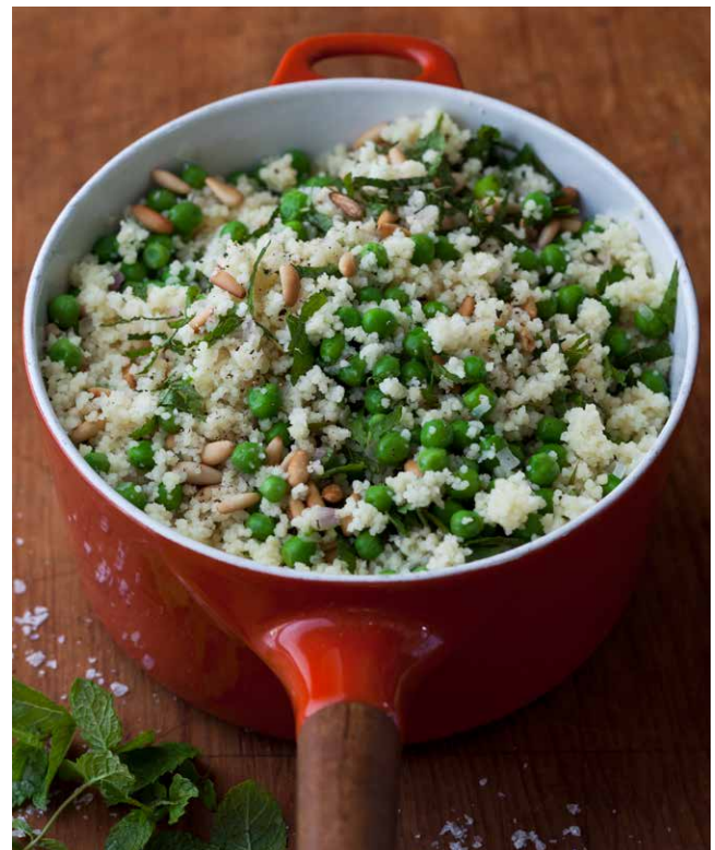
Couscous with Peas & Mint, Foolproof 182