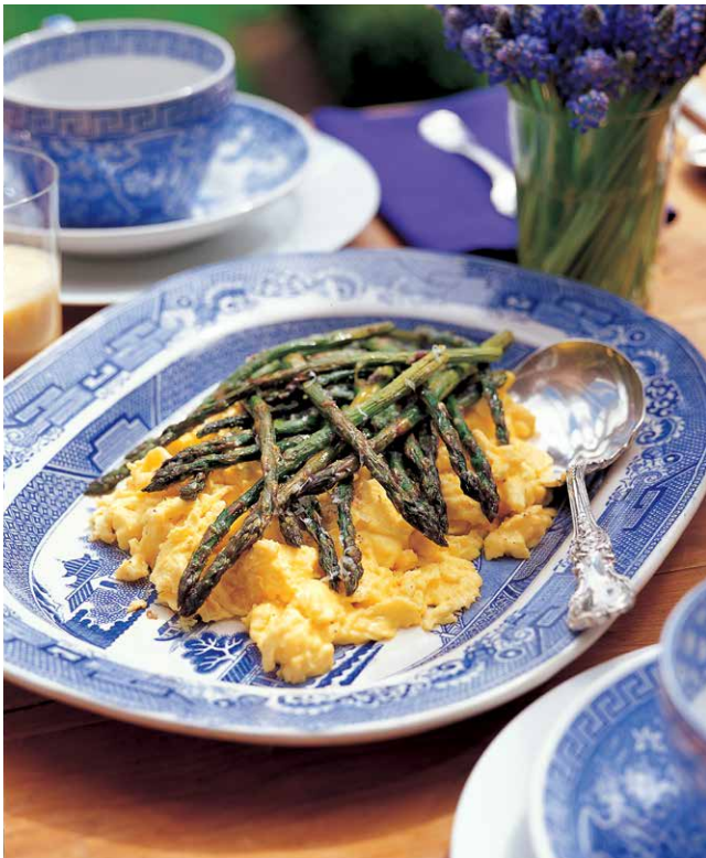
Roasted Asparagus with Scrambled Eggs, Barefoot Contessa Parties! 34