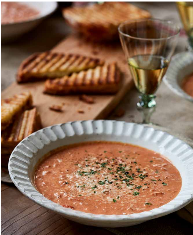
Creamy Tomato Bisque , Modern Comfort Food 83