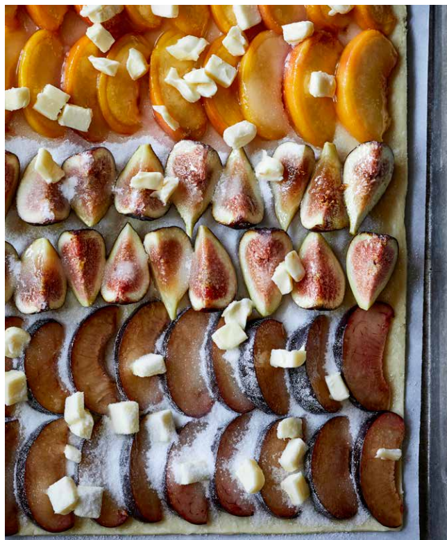
Summer Fruit Tart, Cook Like a Pro 187