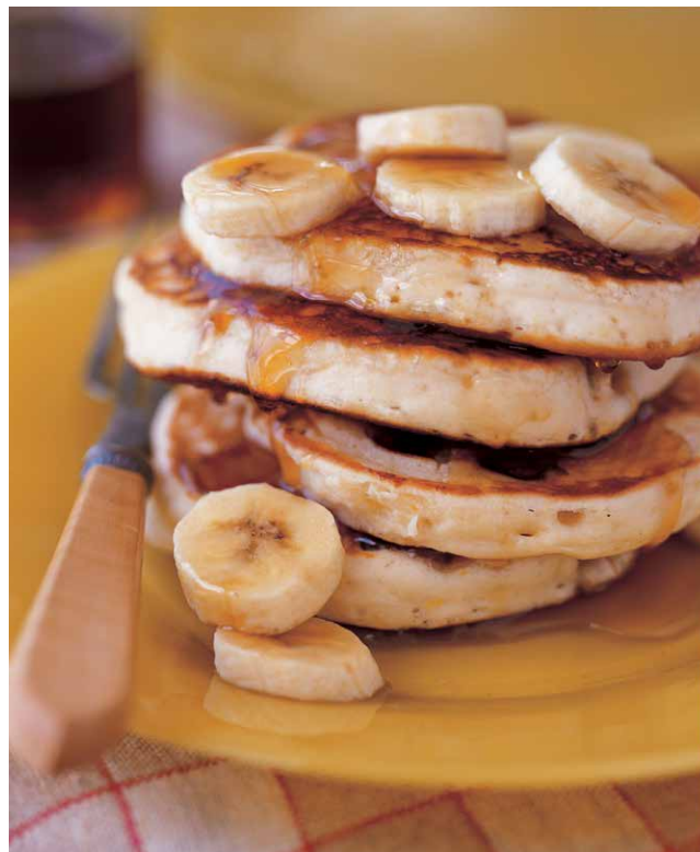
Banana Sour Cream Pancakes, Family Style 177

Anna's Orange Marmalade, At Home 232 Apple Cinnamon Dutch Baby, Modern Comfort Food 237 Bagels with Smoked Salmon & Whitefish Salad, Back to Basics 238 Baked Blintzes with Fresh Blueberry Sauce, Back to Basics 230 Banana Sour Cream Pancakes, Family Style 177 Belgian Waffles & Smoked Salmon, Cook Like a Pro 232 Blueberry Crumb Cake, At Home 230 Breakfast Fruit Crunch, At Home 226 Breakfast Ricotta with Berries & Maple Syrup, Make It Ahead 240 Buckwheat Crêpes "Complète," Modern Comfort Food 233 Challah French Toast, Family Style 187 Chocolate Banana Crumb Cake, Make It Ahead 261 Chunky Apple Butter, Modern Comfort Food 245 Cinnamon Honey Butter, Parties! 41 Easy Cheese Danish, At Home 218 Easy Sticky Buns, Back to Basics 240 Easy Strawberry Jam, Back to Basics 250 Fresh Blueberry Rhubarb Jam, Cook Like a Pro 235 Fresh Fruit Platter, Barefoot Contessa Cookbook 231 Fruit Salad with Limoncello, Back to Basics 248 Garlic & Herb Cream Cheese, Family Style 190 Hashed Browns, Family Style 188 Homemade Granola, Barefoot Contessa Cookbook , 210 Homemade Granola Bars, Back to Basics 242 Homemade Muesli with Red Berries, Back to Basics 234 Honey Vanilla Yogurt, Family Style 194 Lemon Ricotta Pancakes with Figs, Cook Like a Pro 237 Maple Vanilla Cream of Wheat, Make It Ahead 244